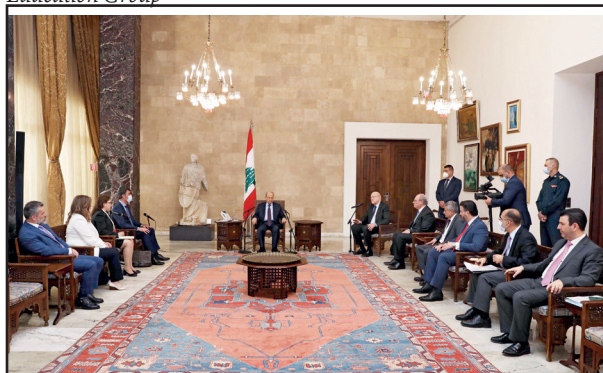
The importance of holding free, fair, transparent and inclusive elections as scheduled: President Michel Aoun meets IMF delegation