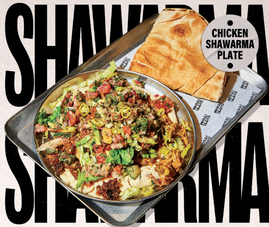
CHICKEN SHAWARMA PLATE