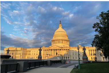
Washington DC Pini Group USA, Inc. 810 7th ST NE Suite 3B Washington, DC 20002