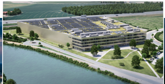
FFB Fab, rendered representation