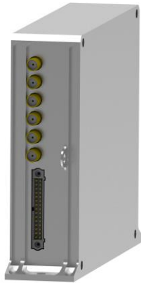
Quasar SDR Transponder

An Intelligent, Fault-Tolerant, Lightweight SmallSat Communications & Navigation Subsystem for Near Earth Orbits and Deep Space Applications