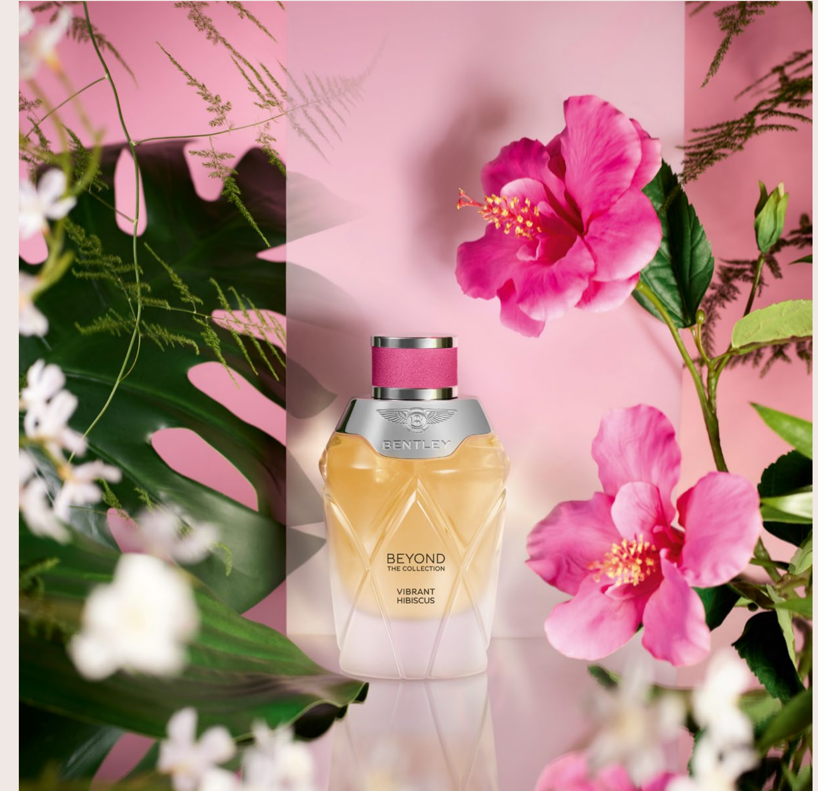
An odyssey to Seoul, South Korea, with Vibrant Hibiscus , a floral scent.