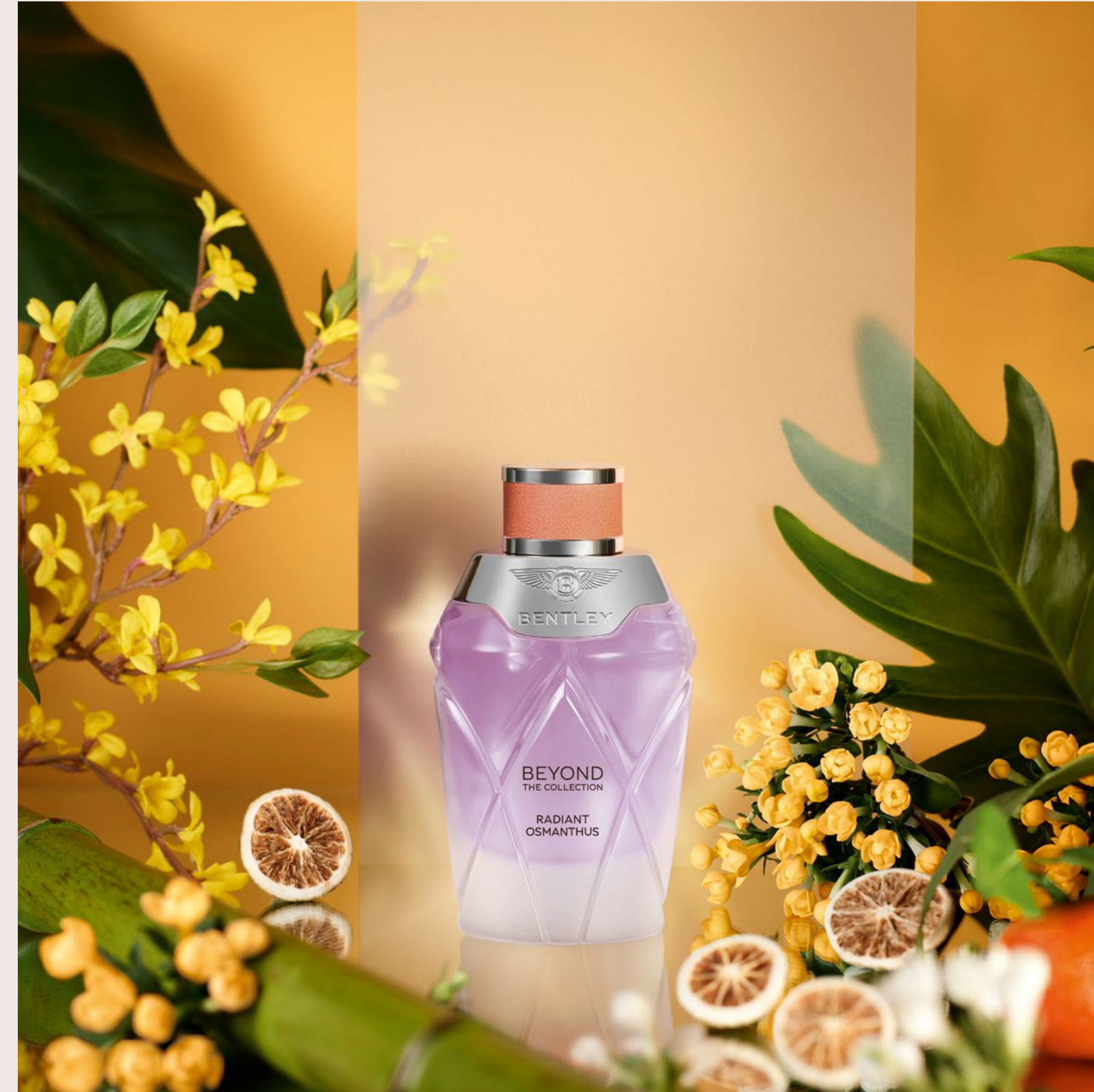
A voyage to Kyoto, Japan, with Radiant Osmanthus , a fruity floral fragrance.