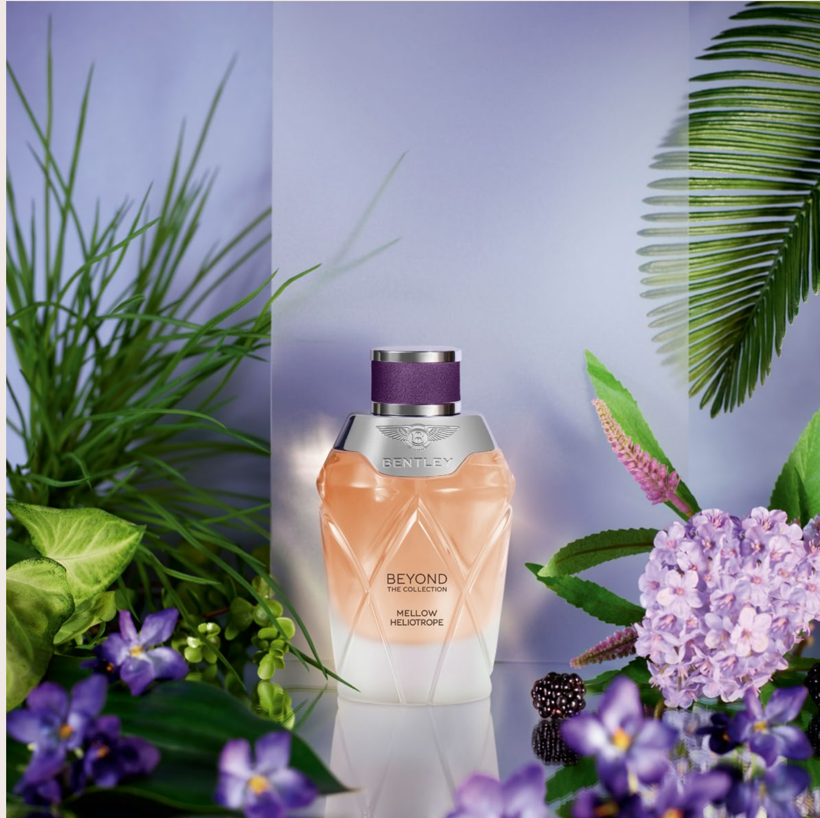
A trip to Lima, Peru, with Mellow Heliotrope , a floral oriental composition.