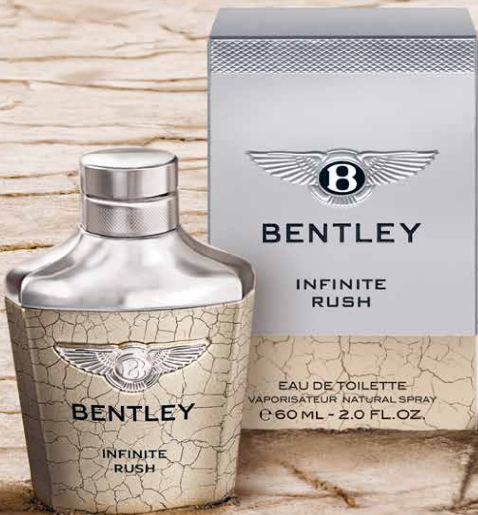
BENTLEY INFINITE RUSH EAU DE TOILETTE, 60 ml