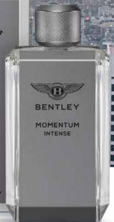
BENTLEY MOMENTUM INTENSE EAU DE PARFUM, 100 ml