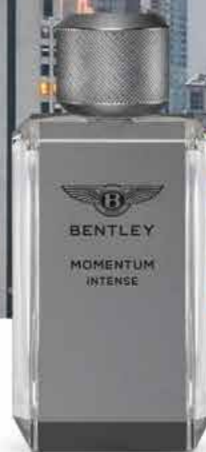
BENTLEY MOMENTUM INTENSE EAU DE PARFUM, 60 ml