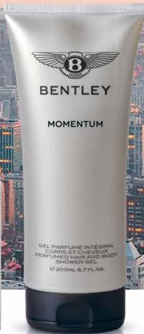
BENTLEY MOMENTUM PERFUMED HAIR AND BODY SHOWER GEL, 200 ml