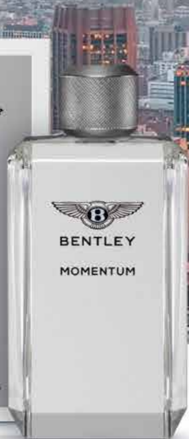
BENTLEY MOMENTUM EAU DE TOILETTE, 100 ml