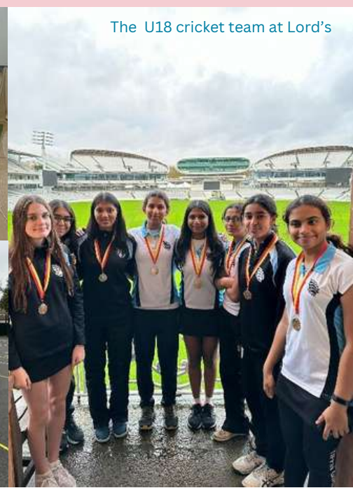
The U18 cricket team at Lord’s