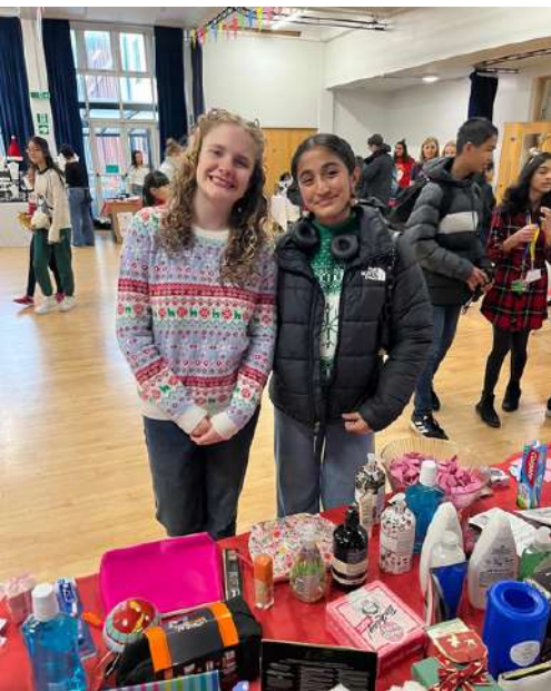
Students enjoying the PSA Christmas Fair